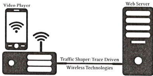
Figure 1: The data-driven generation testbed.

shaper for link between server and intermediate device. The traffic shaping procedure includes the use of traffic shaping tools like Linux traffic control (tc) for emulation of different bandwidth profiles from collected bandwidth logs. The intermediate device connects to the end device via WiFi channel. Finally, the end device streams content from the server via a bottleneck link creating the video log after streaming finishes.